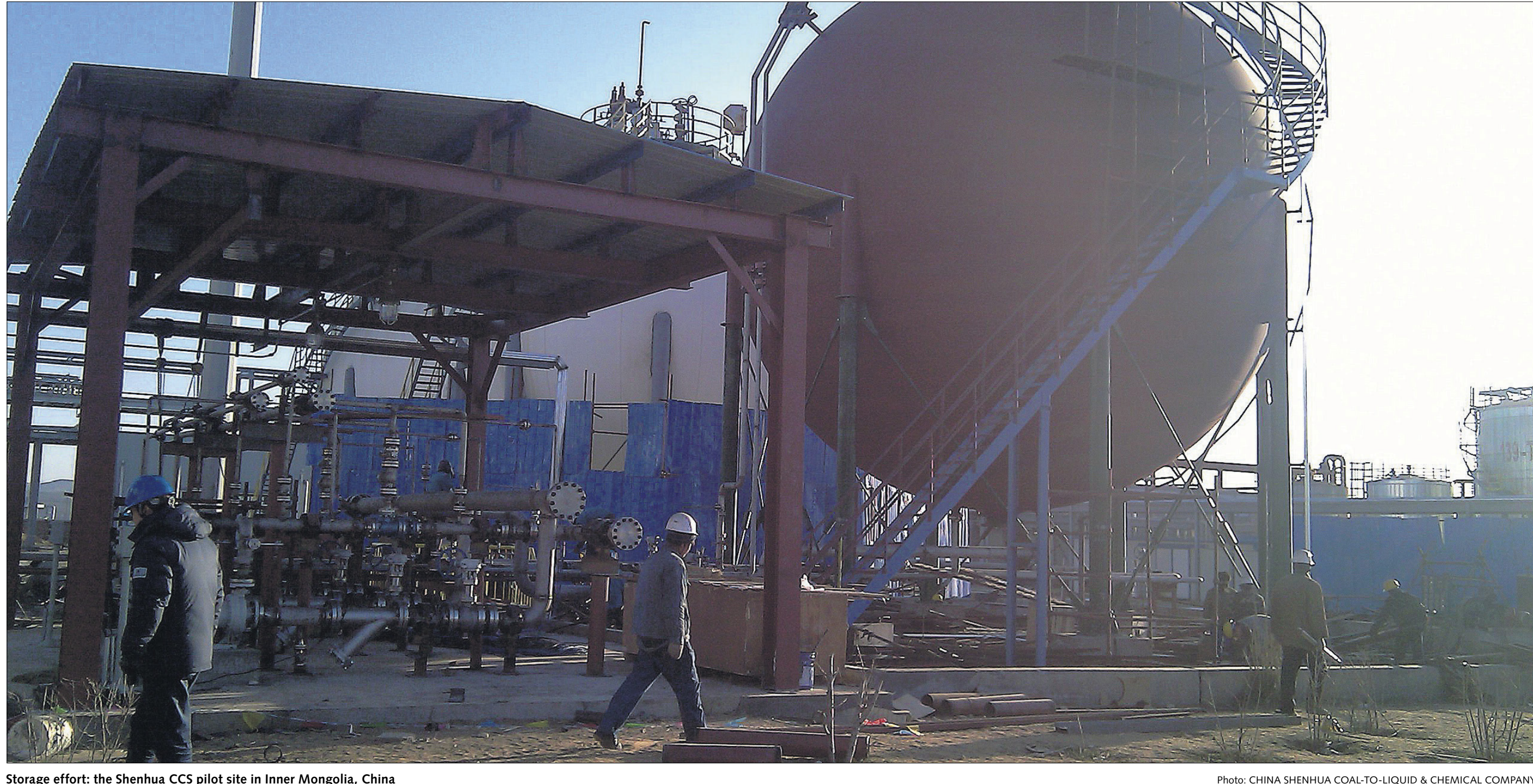
Storage effort: the Shenhua CCS pilot site in Inner Mongolia, China

Abu Dhabi faces up to harsh reality: Pages 40&41